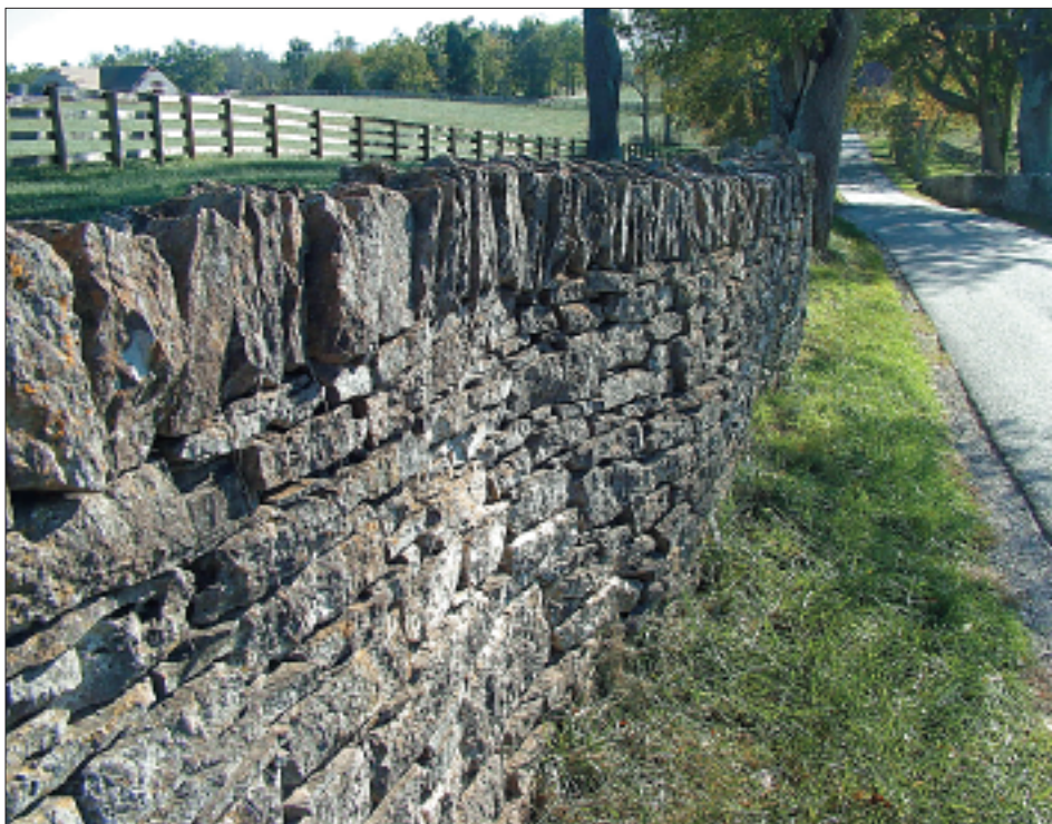
Most nineteenth-century stone fences are now backed up by plank fences.

ized equine landscape. While the owners of elite horse farms continued to build various types of rock fences several decades into the twentieth century, most farmers eventually tore them down to accommodate increased mechanization and reduce maintenance costs. This makes the surviving rock fences even more powerful symbols of the equine landscape.