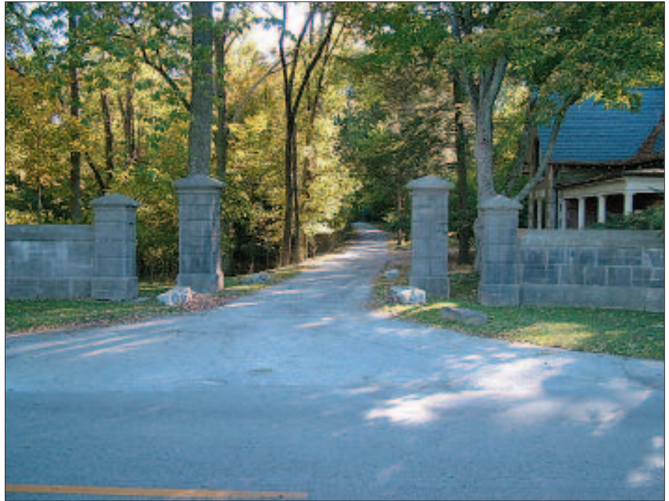
Built in the 1850s, the entrance to Woodburn Farm was a model for horse farm gates in the Bluegrass.

venience," a writer for the Spirit of the Times exclaimed in 1856. "He has small enclosed fields and paddocks for his stock near the buildings, and is constantly adding to them. He has adopted a grand plan of stone enclosure and water accommodation which, when carried out and perfected, will probably make Woodburn