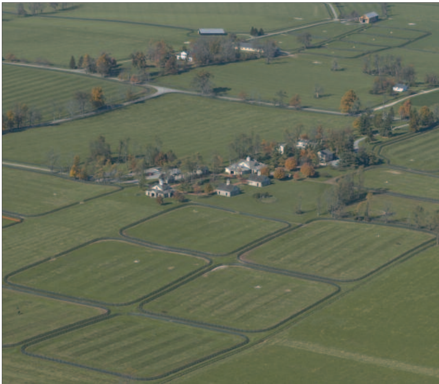
The stallion complex at Three Chimneys Farm near Midway, Kentucky.

Straightening out the pedigrees of horses in Kentucky was not an easy task, however. It was common for pedigree lines to be suspect, even fictitious, in the early going, leading to controversies about the breeding history of many horses. Critics accused Alexander of not knowing enough about American pedigrees to sort out fact from fiction. The argument raged for years. Even though it may have included some padded pedi-