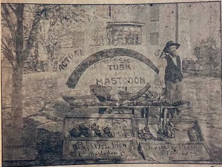
The late T. W. Hunter standing near cases of prehistoric bones dug up by him near the old Blue Lick well. This collection is now in the museum at Blue Lick Battlefield Park.